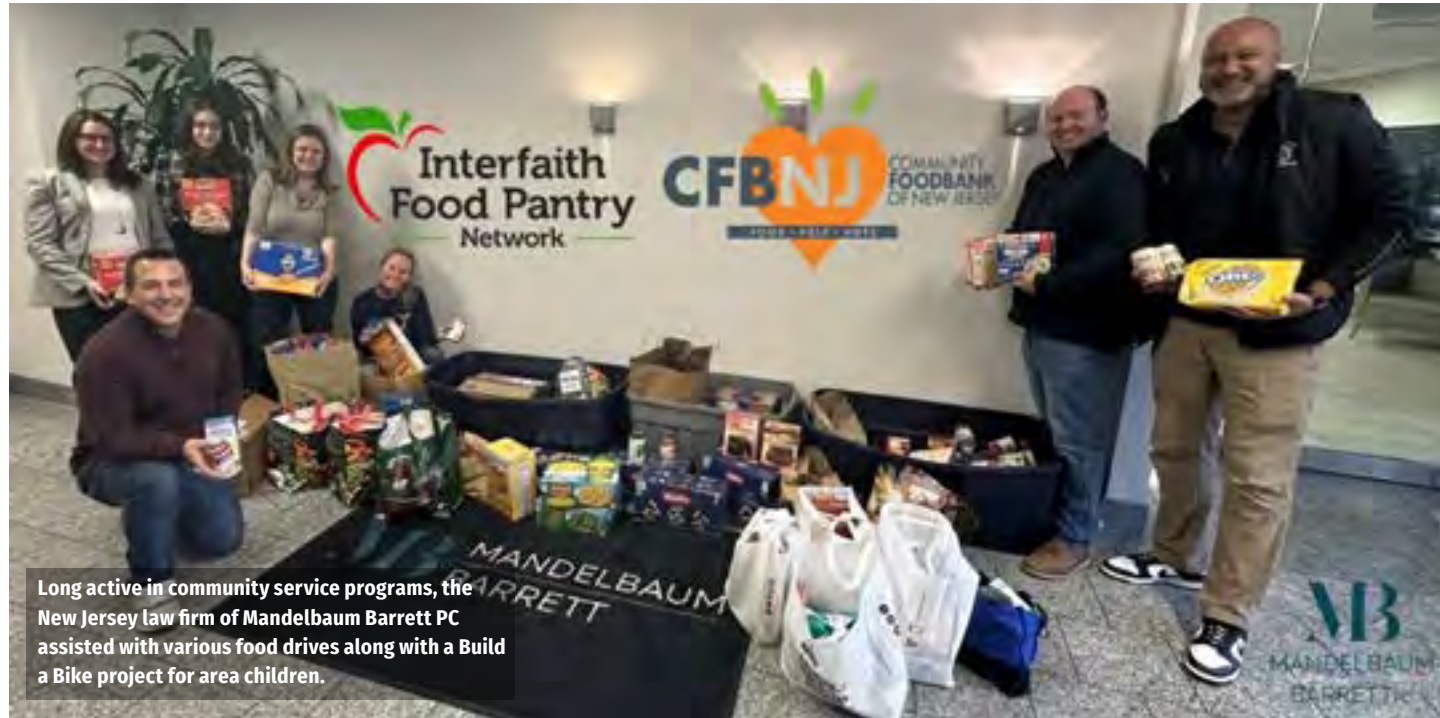
Long active in community service programs, the New Jersey law firm of Mandelbaum Barrett PC assisted with various food drives along with a Build a Bike project for area children.