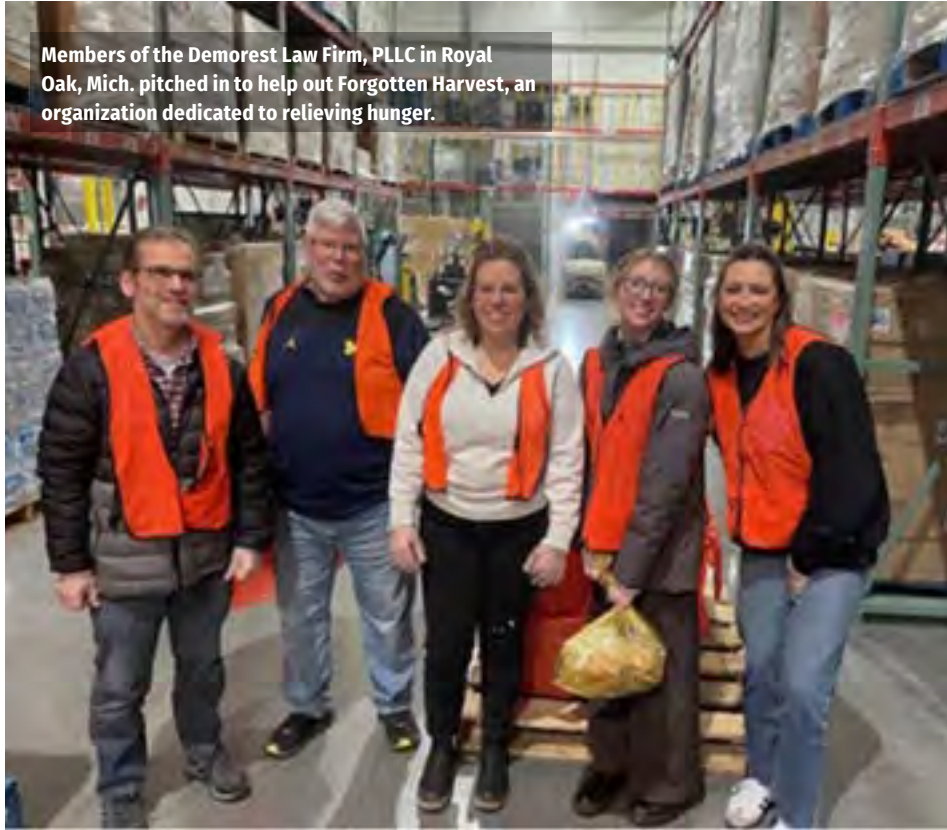
Members of the Demorest Law Firm, PLLC in Royal Oak, Mich. pitched in to help out Forgotten Harvest, an organization dedicated to relieving hunger.

are involved in work at local food pantries to provide meals and others lending help to pack backpacks filled with school supplies for students.”