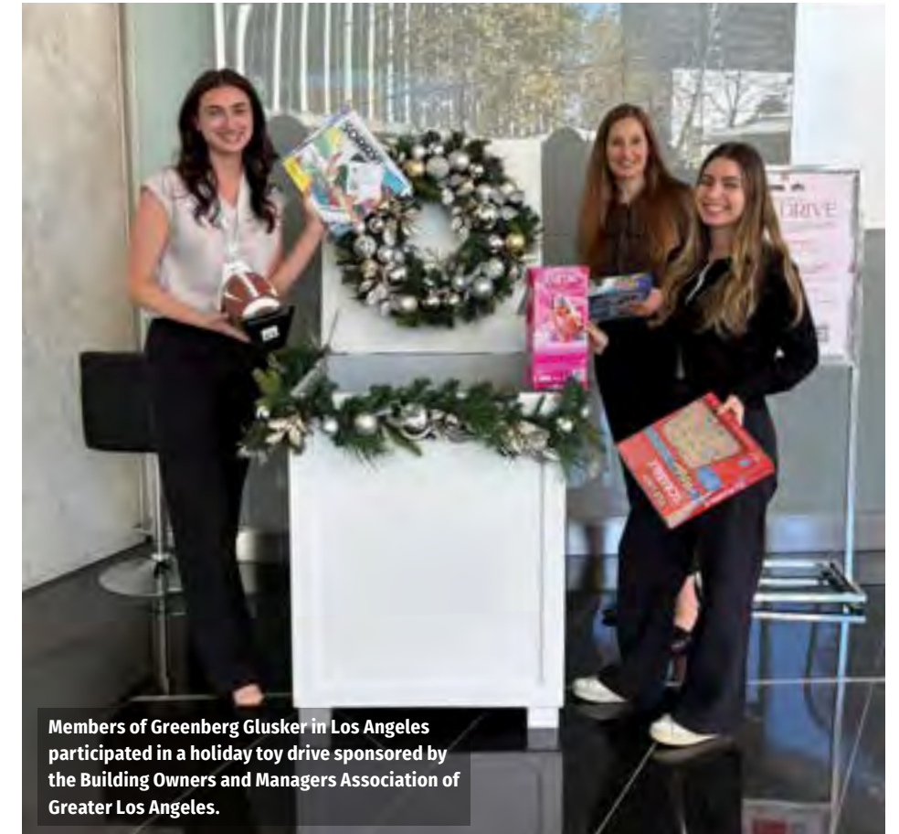
Members of Greenberg Glusker in Los Angeles participated in a holiday toy drive sponsored by the Building Owners and Managers Association of Greater Los Angeles.