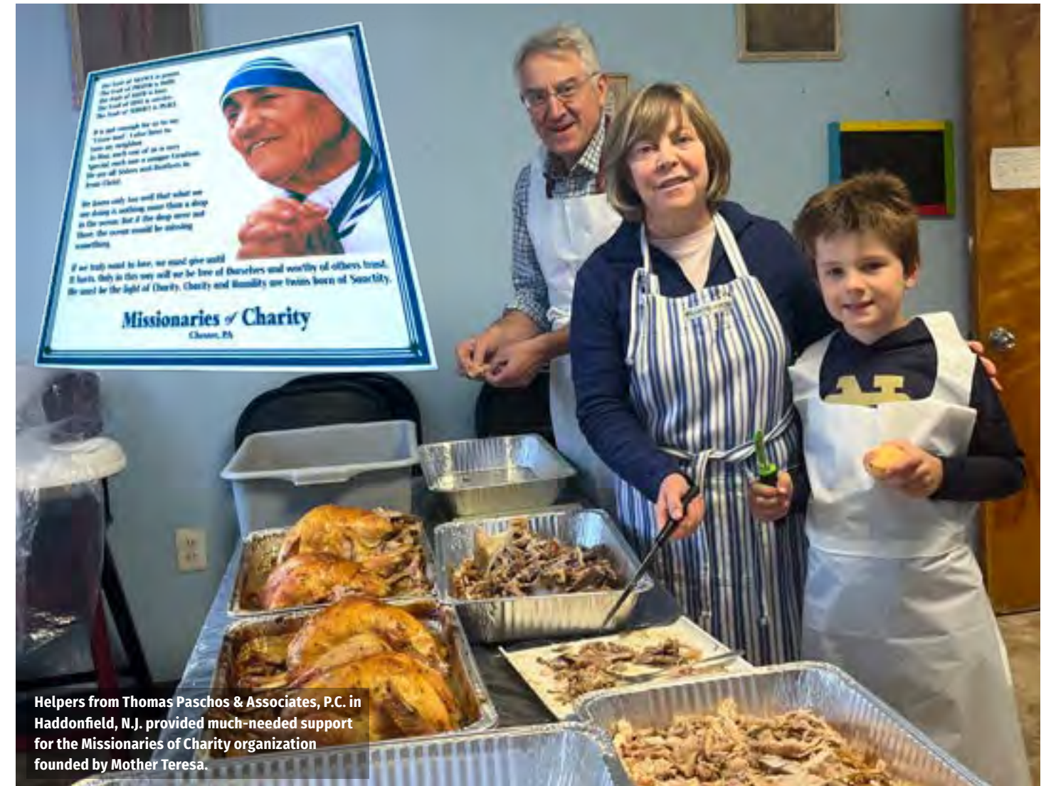
Helpers from Thomas Paschos & Associates, P.C. in Haddonfield, N.J. provided much-needed support for the Missionaries of Charity organization founded by Mother Teresa.