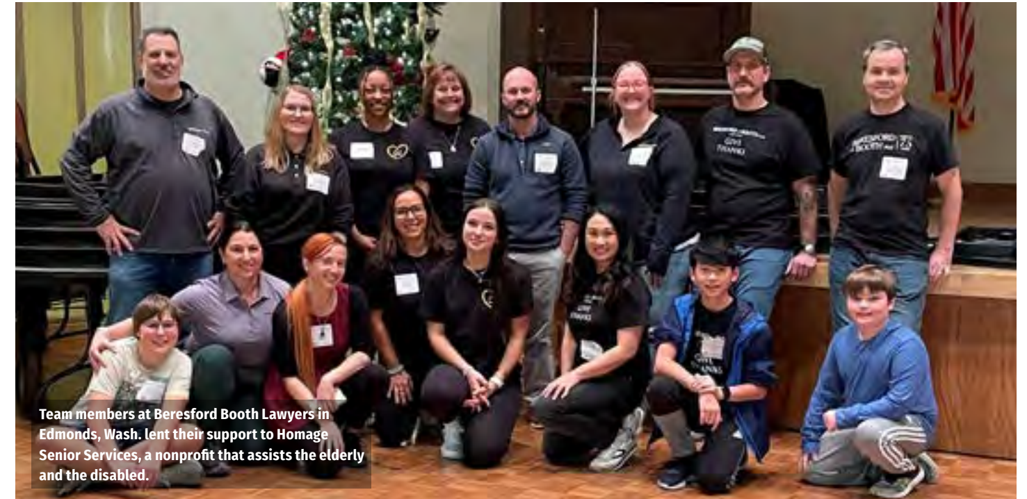
Team members at Beresford Booth Lawyers in Edmonds, Wash. lent their support to Homage Senior Services, a nonprofit that assists the elderly and the disabled.