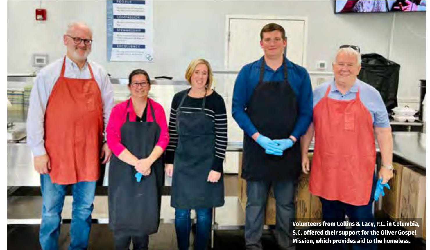
Volunteers from Collins & Lacy, P.C. in Columbia, S.C. offered their support for the Oliver Gospel Mission, which provides aid to the homeless.

When you see the looks on the faces of the families receiving the gifts, it is priceless. It makes all the work worthwhile in helping spread some joy into their lives.”